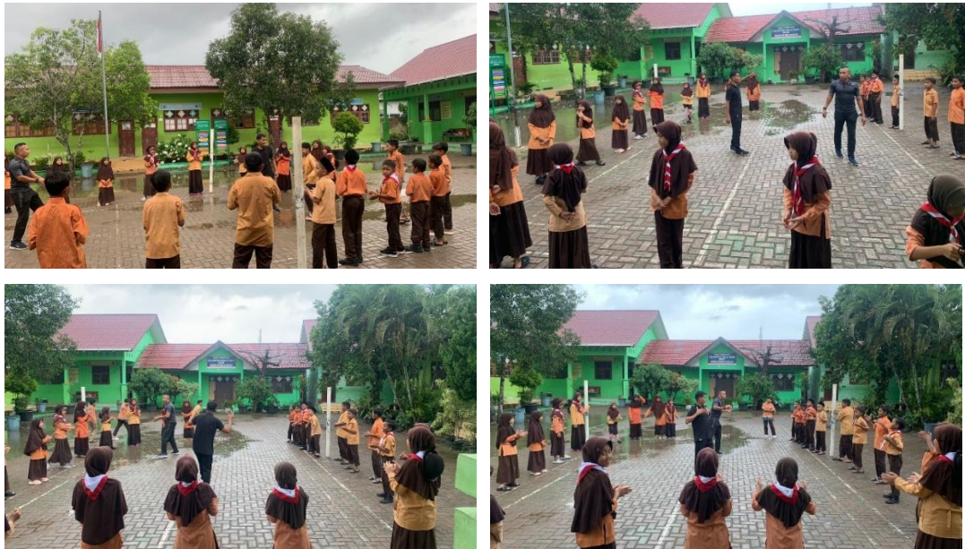
Figure 1. Character building in Pramuka activities